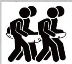
Move Casualty by Side Carrying