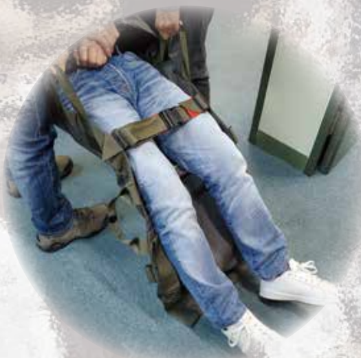
HALF BED (SITTING POSITION) HANDLE METHOD