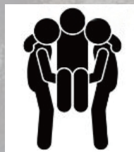
Move Casualty in Sitting Position